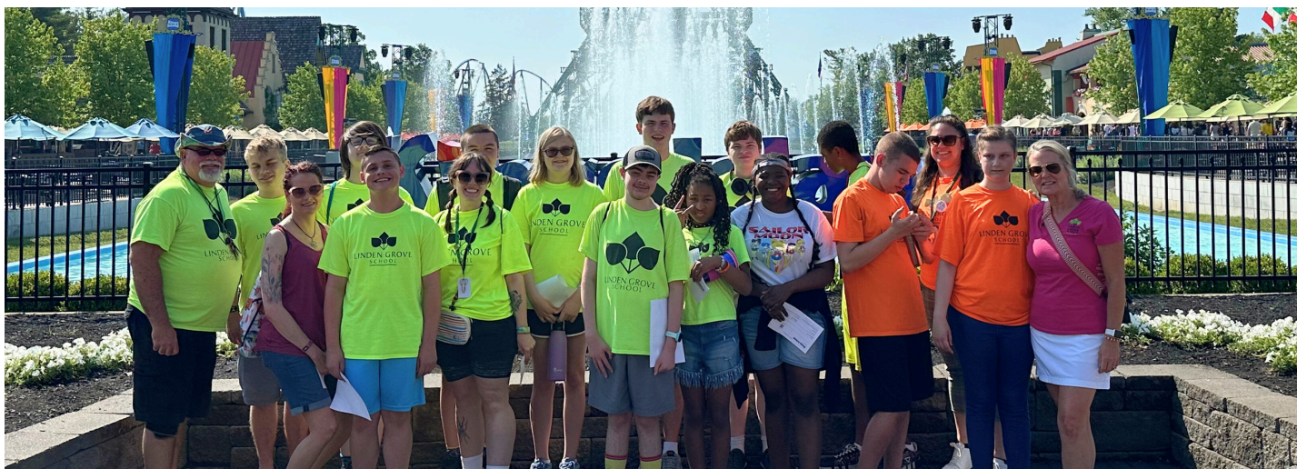
The Class of 2024 on their field trip to Kings Island